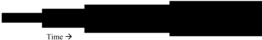
Figure 1: Growth Without Diversification

Aggregate growth theory in economics does a disservice to the understanding of development by abstracting away from the difference between growth and development. A similar "theory" of biological growth of an embryo which saw an increase in food leading to the increase in, say, body weight—plus unspecified changes in "total food productivity"—would not even distinguish between preformation (growth) and epigenesis (development).